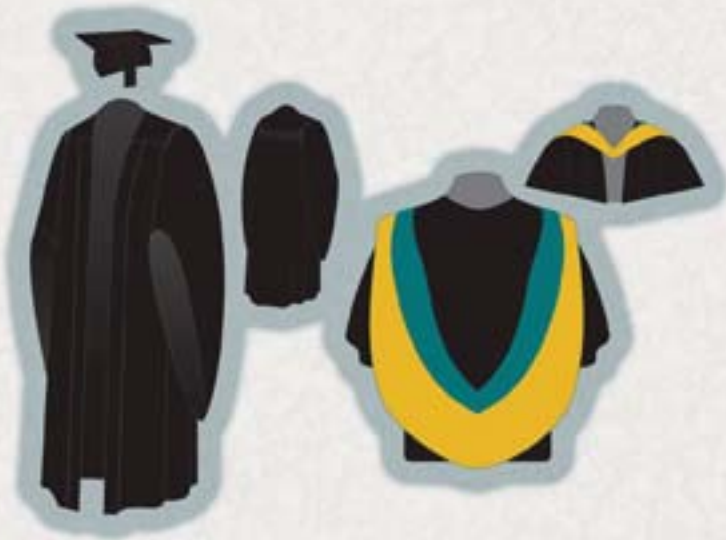
FBDO / FBDO CL / FBDO R