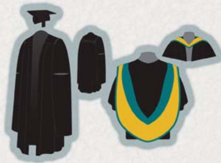
FBDO (Hons) CL / FBDO (Hons) LVA / FBDO (Hons) SLD