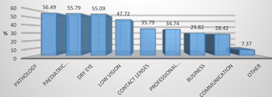
Figure 3: Pathology, paediatrics, dry eye and low vision are popular CET topics