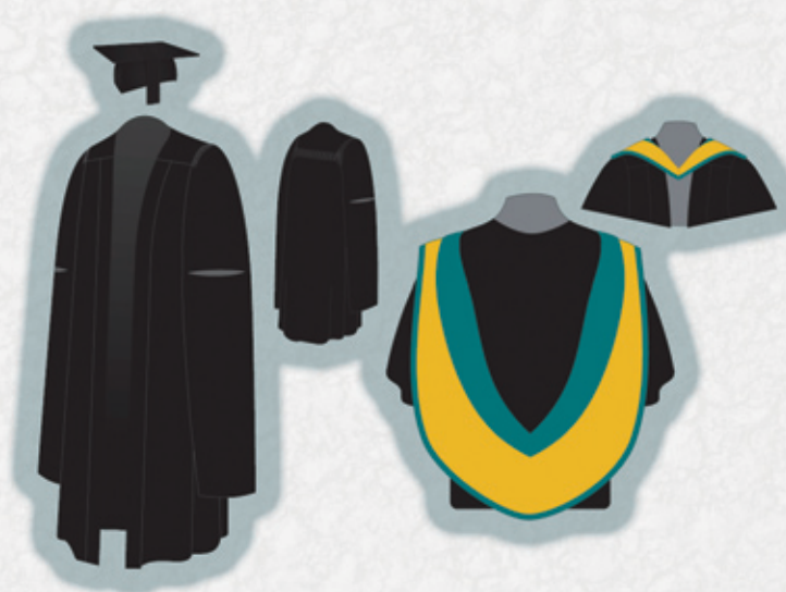
FBDO (Hons) CL / FBDO (Hons) LVA / FBDO (Hons) SLD / HonFBDO

ABDO gowns artwork © Ede & Ravenscroft Ltd