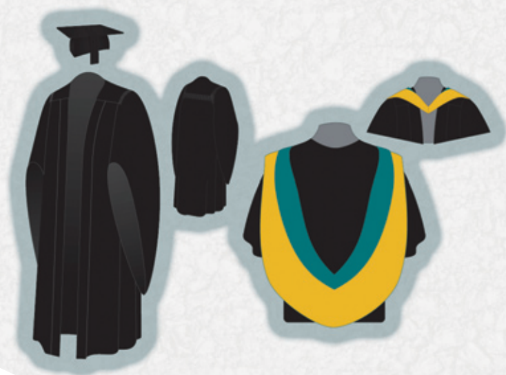
FBDO / FBDO CL / FBDO R