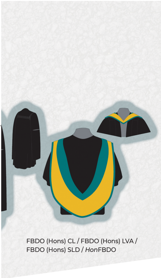
FBDO (Hons) CL / FBDO (Hons) LVA / FBDO (Hons) SLD / HonFBDO

W orking with robe makers Ede & Ravenscroft, thought to be the oldest firm of tailors in the world, ABDO commissioned new academic dress for its Fellows in 2012. Designed by fully acknowledging the traditional origination process, the colourful green and gold hoods are derived from the core colours of the Association crest.