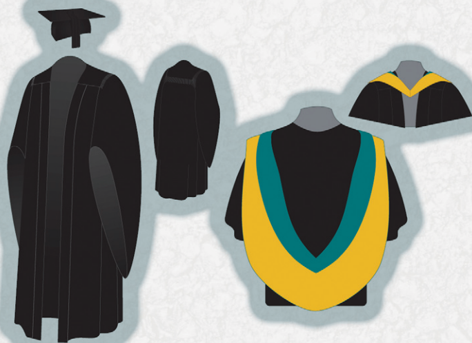
FBDO / FBDO CL / FBDO R / PROF CERT PE

ABDO gowns artwork © Ede & Ravenscroft Ltd