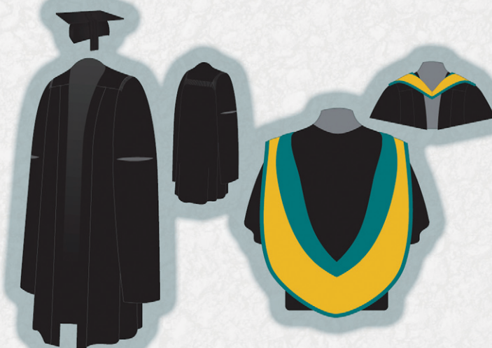
FBDO (Hons) CL / FBDO (Hons) LVA / FBDO (Hons) SLD / HonFBDO

ABDO gowns artwork © Ede & Ravenscroft Ltd